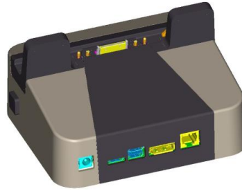
Figure 2: Active Dock